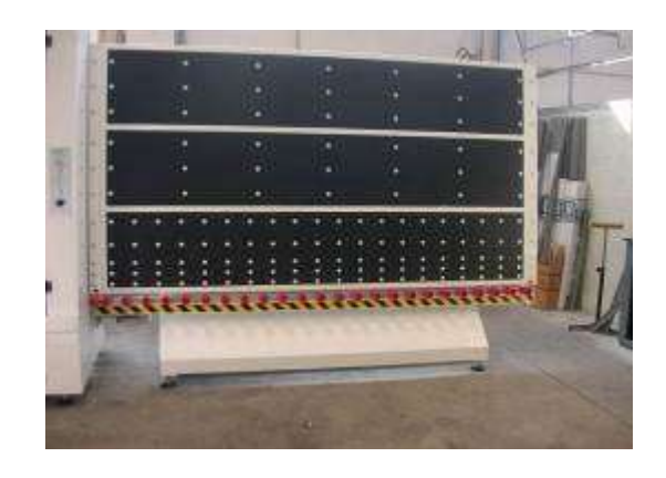
Optional hydraulic tilting table system